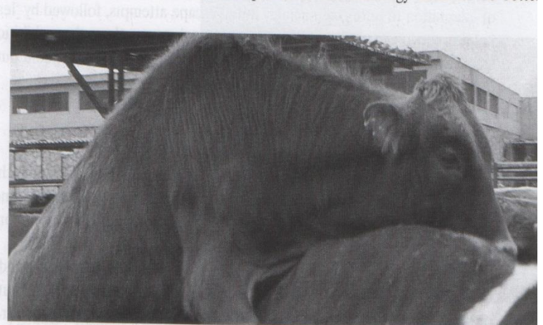
rection in the denotes needs to be belle.