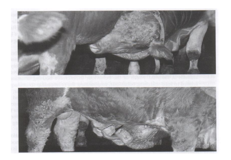
Fig 1. Prepuce sucking in bulls . The sucker reaches under a bull ( above) and stimulates it to urinate by liking the prepuce ( below )